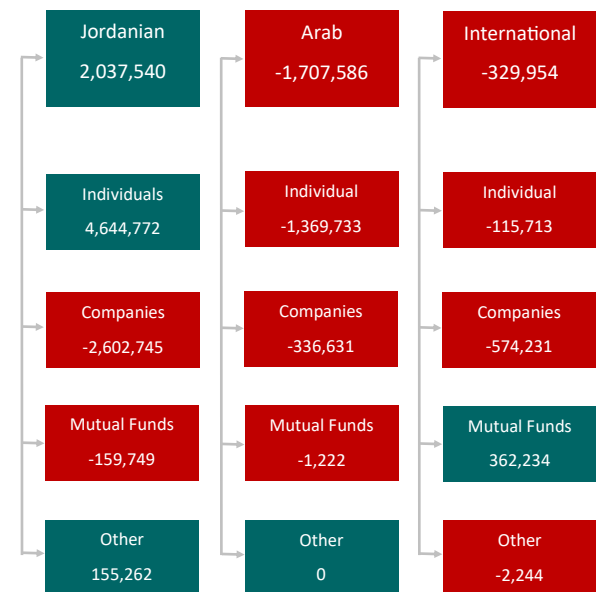
Most Active ASE Nationalities - % No. of Transactions