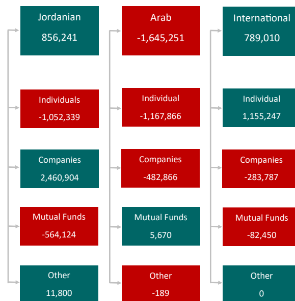
Most Active ASE Nationalities - % No. of Transactions