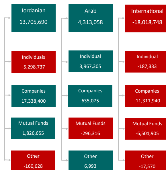
Most Active ASE Nationalities - % No. of Transactions